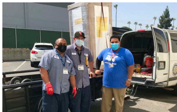
FARSB donates new refrigerator to SAC Health System, San Bernardino

To support community partners who stayed open during the shutdown, FARSB provided food grants, personal protective equipment, food storage units, distribution supplies, and more!